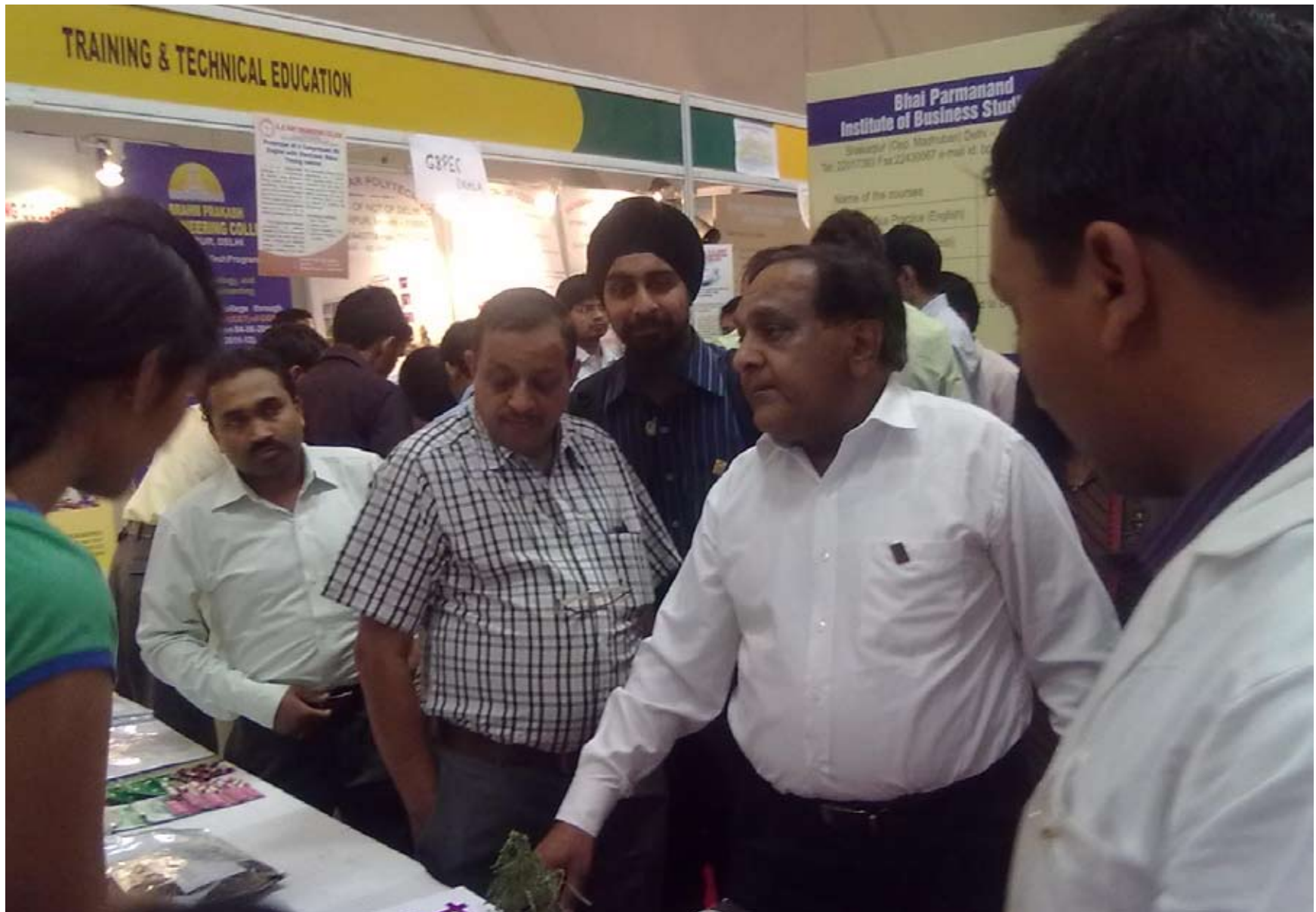
DIPSAR Faculty and Research Scholars participated in Bhagidari Mela