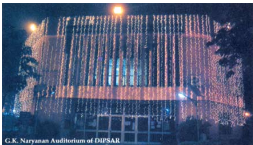
G.K. Naryanan Auditorium of DIPSAR

The Lt. Governor, GNCT of Delhi has declared the first Pharmacy University of India, and perhaps Asia by the name of Delhi Pharmaceutical Sciences & Research University, a state university, w.e.f. 1st Feb, 2010 was enacted by Govt. legislation on 11th September, 2008.