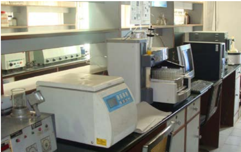
Indian System of Medicine Laboratory.