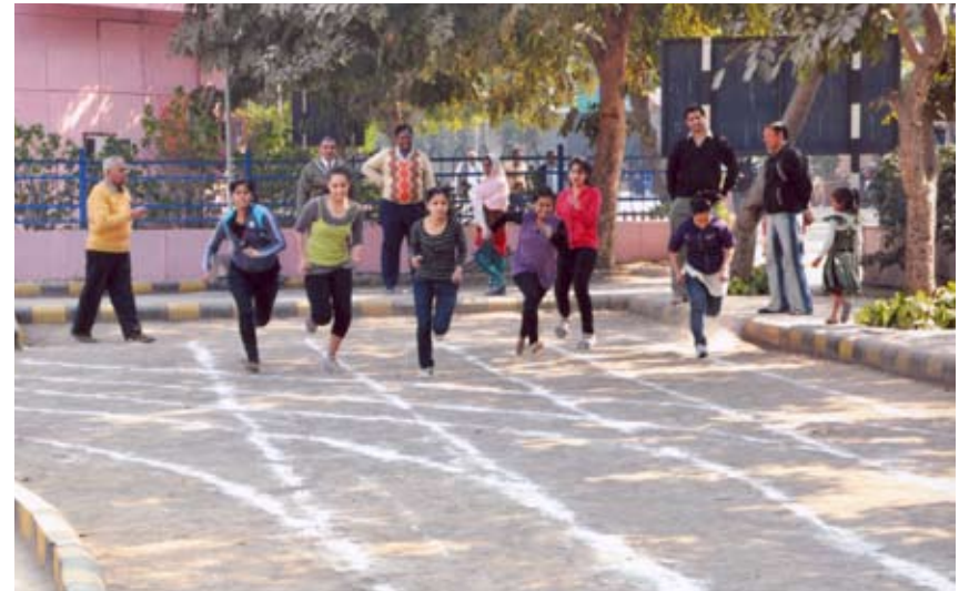
Students of DIPSAR participating in race on sports day