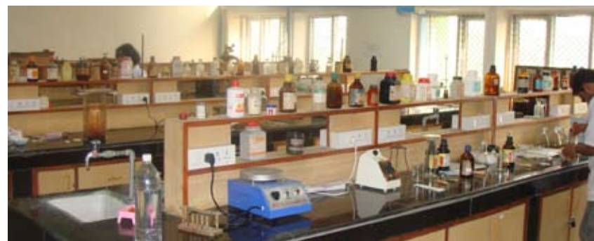
Pharmaceutical Chemistry laboratory