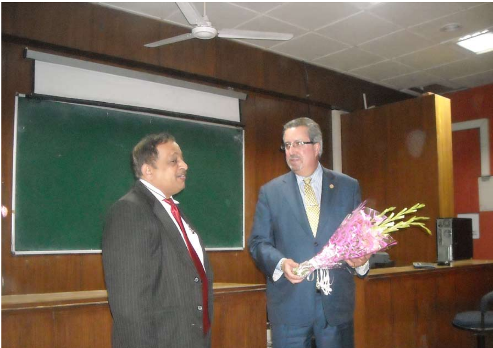
Seminar on Microwave Synthesis.