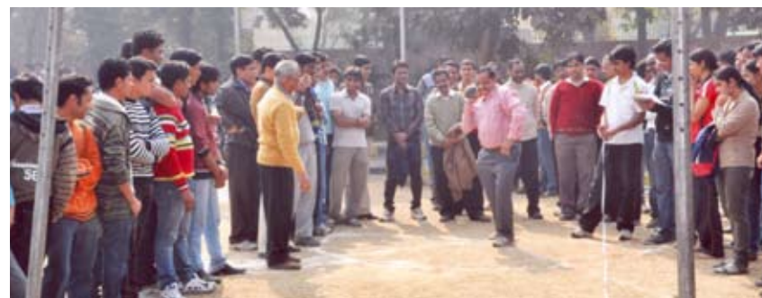
Students and faculty of DIPSAR participating in events like short-put on sport day