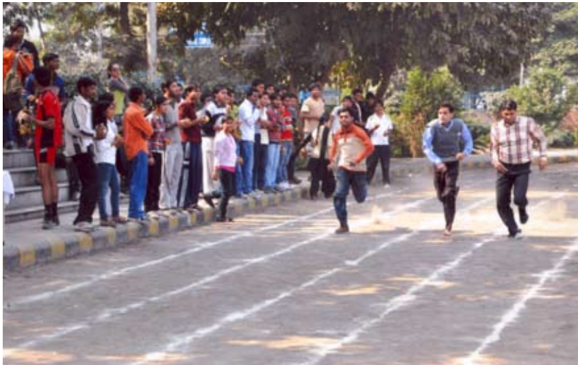
Students of DIPSAR participating in 100 m race on sports day