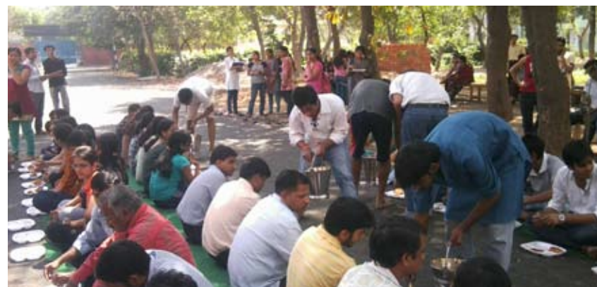
Hanuman Jayanti was celebrated on 18th April 2011 at DIPSAR

MAPIC provides accurate, unbiased factual information to general public and members of the healthcare team such as Physicians, Surgeons,