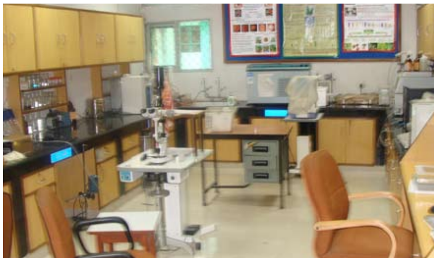
Ocular Pharmacology Laboratory