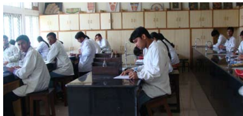
UG Pharmacognosy Lab